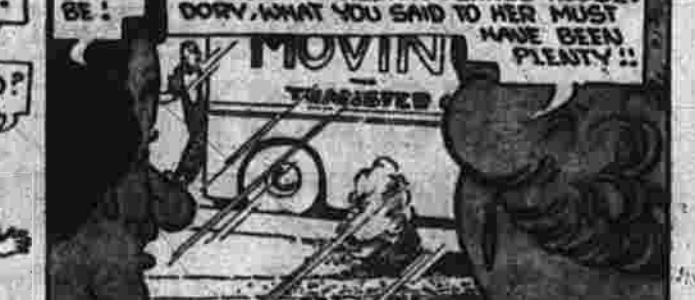
“You realize, of course, that while you're standing there dickerin', your car is depreciatin'!”