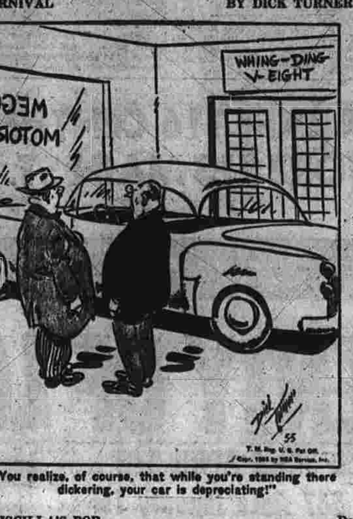
“You realize, of course, that while you're standing there dickerin', your car is depreciatin'!”